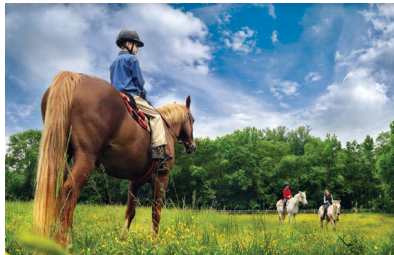
Tanglewood Park, Clemmons