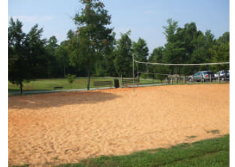
Sand volleyball and walking path at Leinbach Park

Leinbach Park —This 9-acre neighborhood park located at the corner of Robinhood and Sally Kirk Roads has a 1/2 mile loop path, 3 lighted tennis courts, sand volleyball, restrooms, a small playground and covered picnic area. Many people from the surrounding neighborhoods use the path to walk or run.