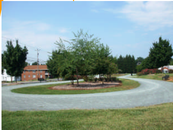
Loop trail at Harambee Park

Harambee Park — One of the smallest city parks at one-acre, this park is located on 14th Street has beautiful landscaping and a walking loop trail. A great place for neighbors to meet and walk!