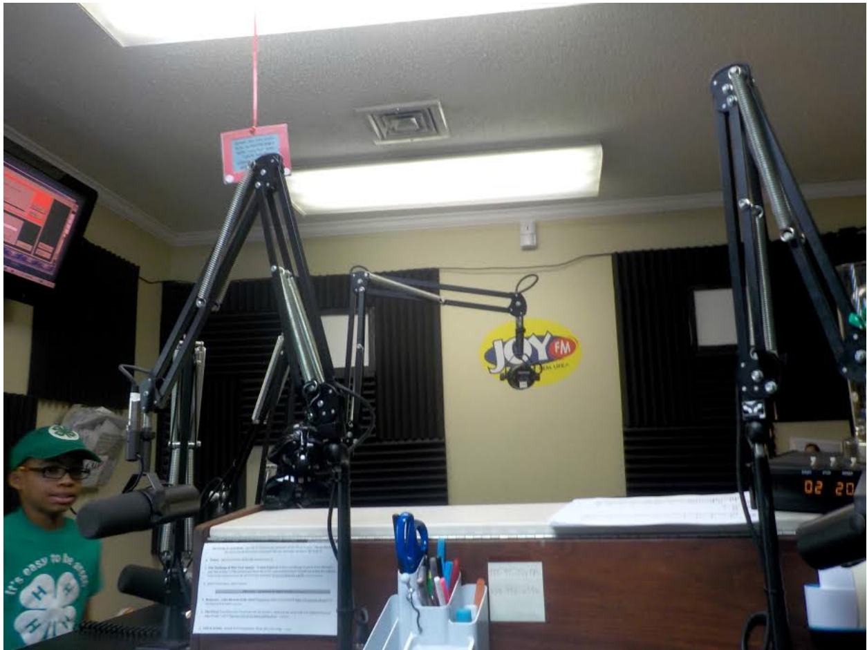
Here is one of our members trying out the equipment.