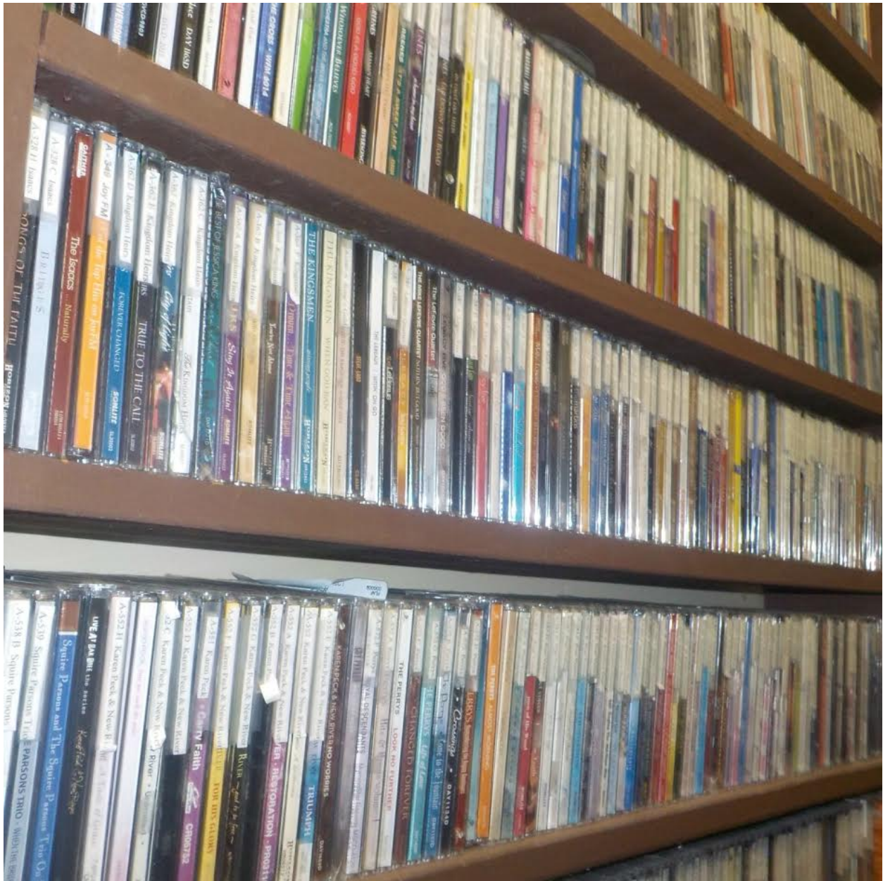
If the computers break, then the CDs take over. "Now what do you have to say about this, CDs?"