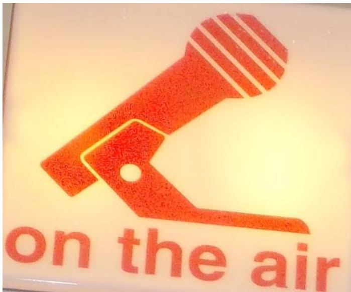
On the air!

Thank you, Joy FM, for the wonderful tour!